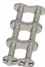
No. 111 (S) Connecting link with cottered pin