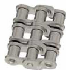
No. 15 (C) Double cranked link