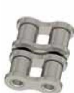
No. 4 (B) Inner link