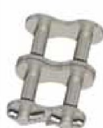
No. 111 (S) Connecting link with cottered pin