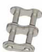
No. 11 (E) Spring clip connecting link