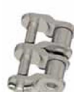
No. 12 (L) Single cranked link