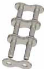
No. 7 (A) Outer link (to be riveted)