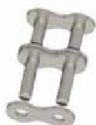
No. 7 (A) Outer link (to be riveted)