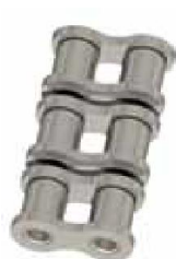
No. 4 (B) Inner link