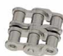
No. 15 (C) Double cranked link