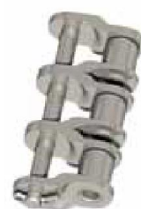
No. 12 (L) Single cranked link