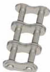
No. 11 (E) Spring clip connecting link